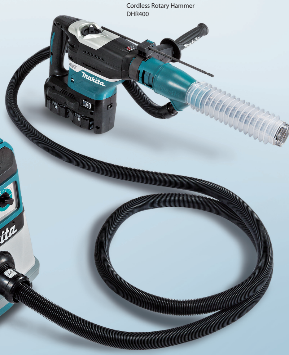
Cordless Rotary Hammer DHR400